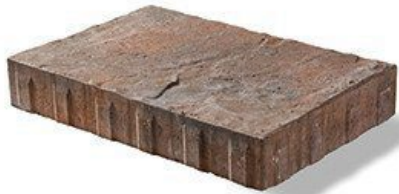
LARGE RECTANGLE 6CM 54 CM X 36 CM X 6 CM 21.25" X 14.25" X 2.25"