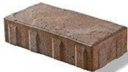
SMALL RECTANGLE 6CM 36 CM X 18 CM X 6 CM 14.25" X 7" X 2.25"