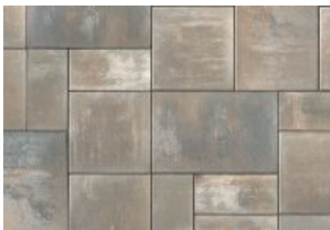
ALMOND GROVE FUSION NEW FOR 2017