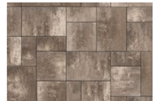
OAK BROWN FUSION NEW FOR 2017