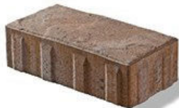
7 X 14 6CM 18 CM X 36 CM X 6 CM 7" X 14.25" X 2.25"