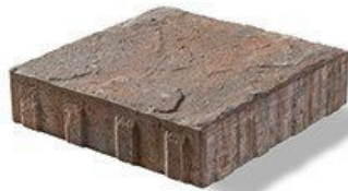
SQUARE 6CM 36 CM X 36 CM X 6 CM 14.25" X 14.25" X 2.25"