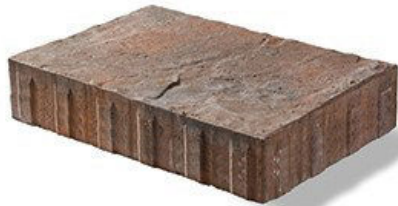
LARGE RECTANGLE 8CM 54 CM X 36 CM X 8 CM 21.25" X 14.25" X 3.25"