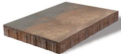
21 X 28 6CM 53 CM X 71 CM X 6 CM 20.75" X 28" X 2.25"