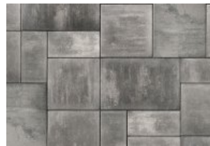
GRANITE FUSION NEW FOR 2017