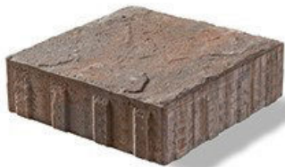
SQUARE 8CM 36 CM X 36 CM X 8 CM 14.25" X 14.25" X 3.25"