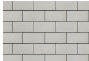
OPAL AVAILABLE IN 7 X 14"