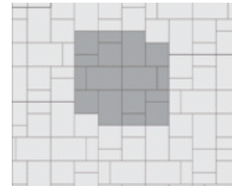
Beacon Hill B 8cm