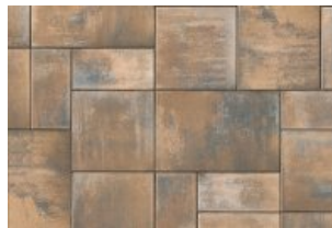
DESERT SAND FUSION NEW FOR 2017