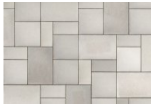
OPAL BLEND NEW FOR 2017