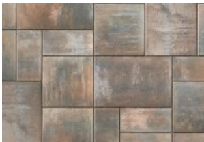
SIERRA FUSION NEW FOR 2017