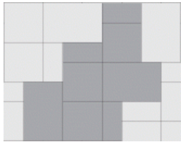
Beacon Hill A