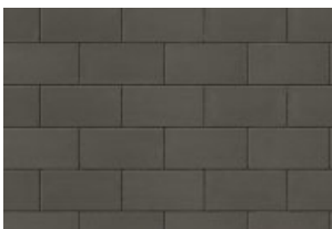
MIDNIGHT CHARCOAL AVAILABLE IN 7 X 14"